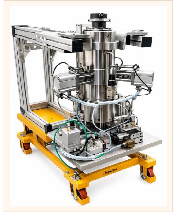
Complete QRC system on trolley

Three pressure-compensated lateral LVDTs, positioned by pneumatic jacks, measure diametral strains in step mode. Two averaging vertical LVDTs measure axial strain. The cell integrates into a complete test stand with high-pressure pumps, external axial actuator, signal conditioning and live stress-strain display.