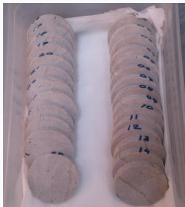
Carbonate disks ready for the RDR test