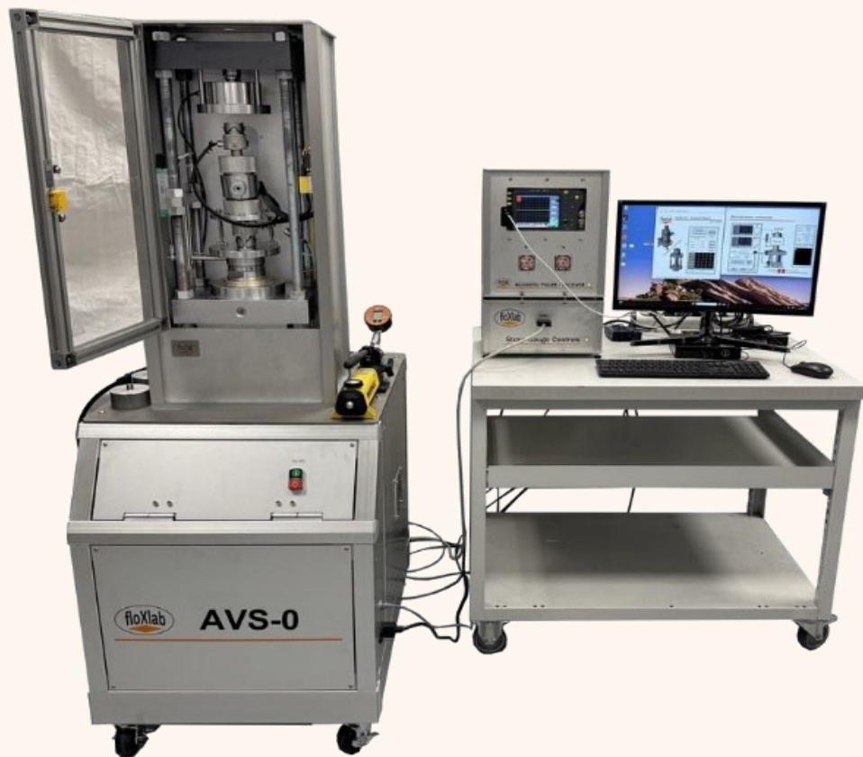
AVS-0 — 300 kN compression frame coupled to acoustic triaxial cell

Acoustic velocity measurement under confining pressure — ASTM D2845